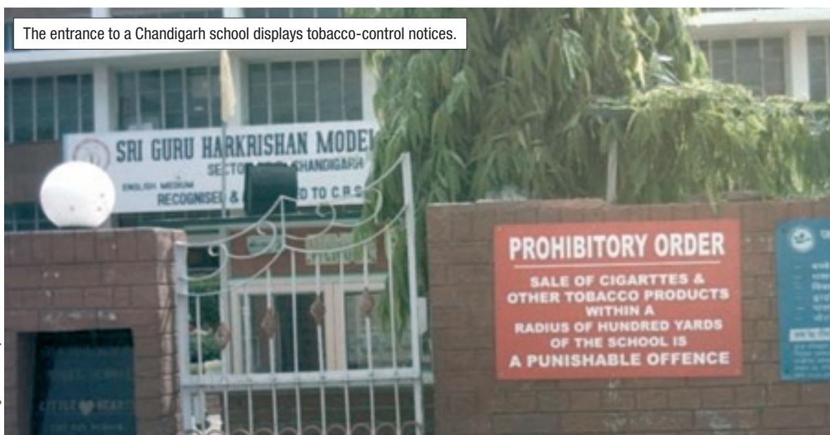
The entrance to a Chandigarh school displays tobacco-control notices.

Because the legislation allows designated smoking areas, it is not as protective as some other laws worldwide. Myths regarding the impact of smokefree laws on restaurants and bars have been hard to overcome.