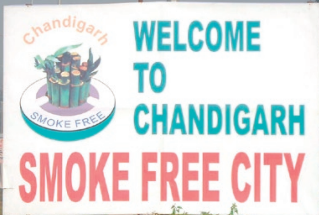
Welcome sign: A smokefree billboard at the city gateway highlights Chandigarh's smokefree status.

February 2003 – Tobacco Control Bill approved.